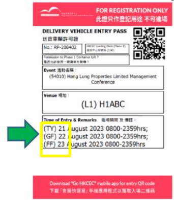
e-Vehicle Permit Sample (For Ref only)